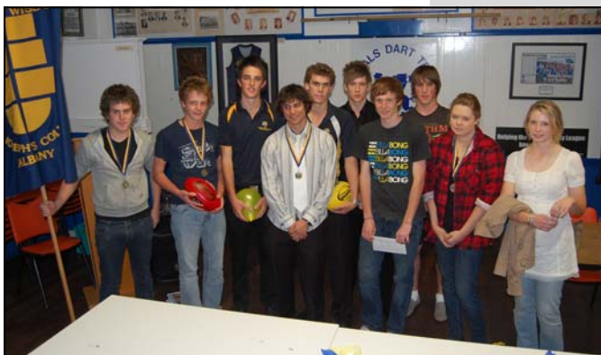
2010 Football Winners