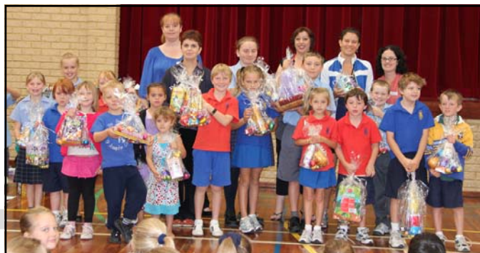
A lot of happy winners from the Junior School P&F Easter Raffle Draw