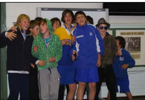
Last Year's Camp Participants had fun learning about creatures.